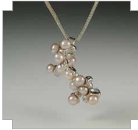
4.9 Teddy Tedford Cosmic Cluster of Pearls | Pendant Sterling Silver, Pearls | $195