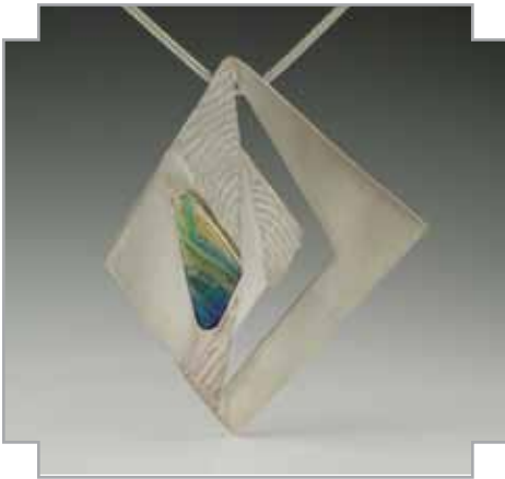
4.11 Nancy McLean Finding My Space | Pendant Boulder Opal, Silver | NFS