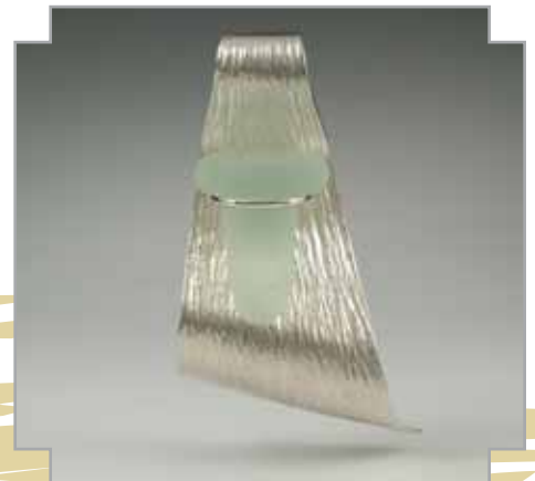
4.7 Greig Bishop Wave | Pendant Silver, Glass | NFS