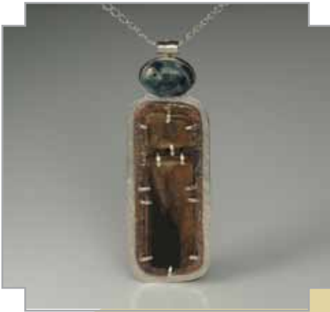
4.14 Lynda Lou MacIntyre Blue Moon Rising | Pendant Sterling Silver, Copper, NS Petrified Wood, Canadian Lapis, SS Chain | $400