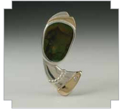
10.2 Chris Shute Space Dame | Pin Sterling Silver, 10K, Ammonite, Diamond | $550