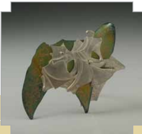
11.9 Candice Prior Spaceship Disaster | Pin Copper & Silver | $40