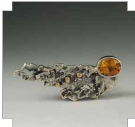
6.1 Chris Shute Gold Streak (Comet) | Pin Sterling Silver, 14K, Golden Beryl | $400