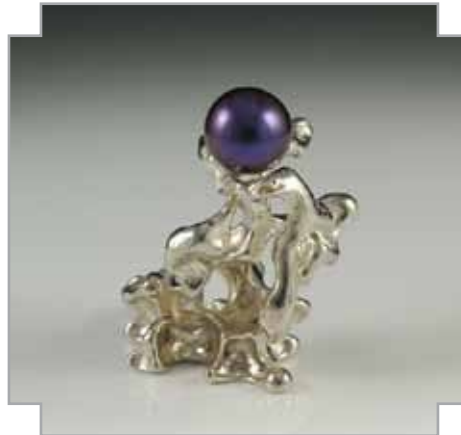
9.1 Teddy Tedford Bonsai or Alien | Cast Sculpted Stand Alone Sterling Silver & Purple Pearl | $60