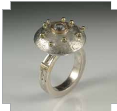
10.4 Susana Hernandez Space Ship | Ring with Zircon 10K & Silver | $600