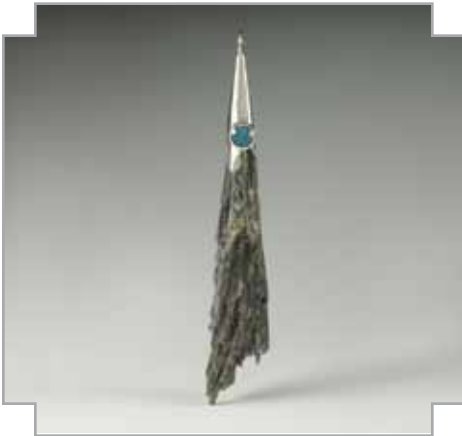
4.2 Bill Danberger Exhausted | Pendant Kyanite Stone, Swiss Blue Topaz, Silver Hollow Ware | $95