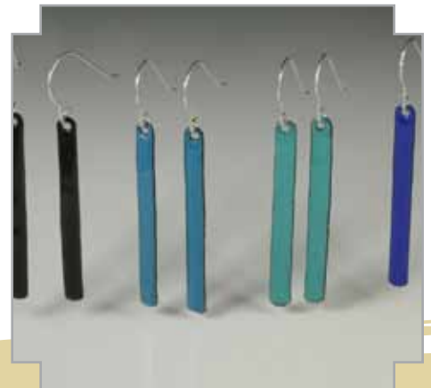
8.2 Larry Knox Parallels | Earrings Copper, Sterling Silver, Enamel | $50/pr