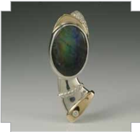
11.6 Chris Shute Space Out | Pin Sterling Silver, 10K, Labradorite, Diamond | $500