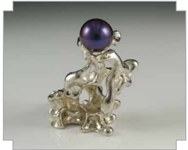
9.1 Teddy Tedford Bonsai or Alien | Honourable Mention Sculpture