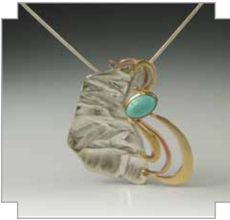
11.3 Lynda Lou MacIntyre Fonta Magia | Necklace Sterling Silver, 14K Yellow Gold, 14K Rose Gold, Mexican Turquoise | NFS