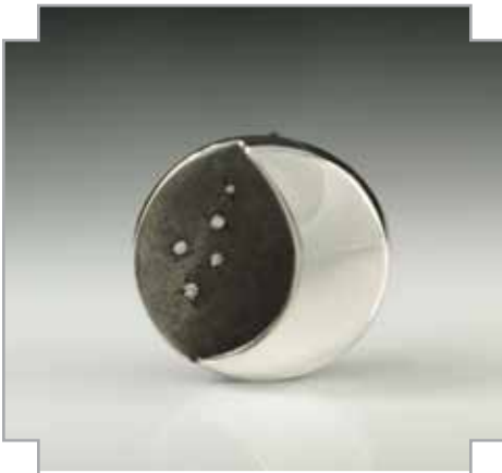
10.3 Graeme Ross You Are My Moon and Stars | Pendant Sterling Silver, Diamond | $200