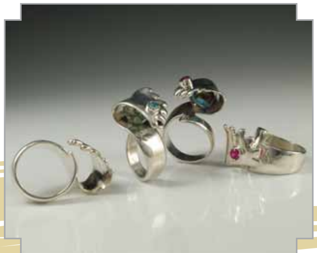
8.1 Bill Danberger Galactic Tsunami | Honourable Mention Production