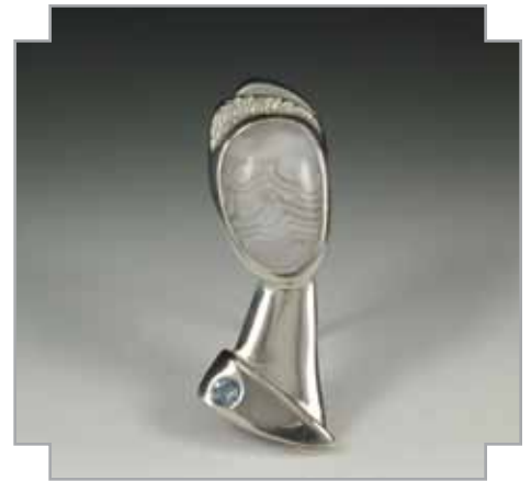
2.2 Chris Shute Staring Off Into Space | Pin Sterling Silver, NS Agate, Zircon | $300