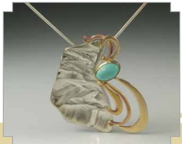
11.3 Lynda Lou MacIntyre Fonta Magia | Honourable Mention Mixed Metals