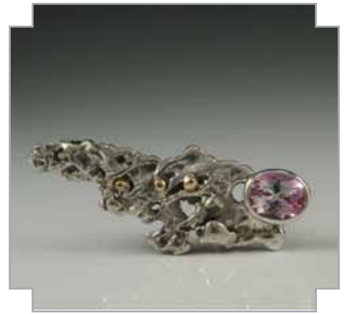
11.5 Chris Shute Pink Streak (Comet) | Pin Sterling Silver, 14K, Pink Topaz | $300