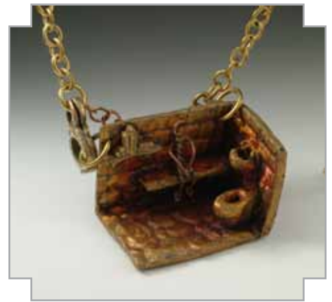
7.2 Cathy Logan Historical Confined Space | Pendant Bronze, Brass, China Paint | $100