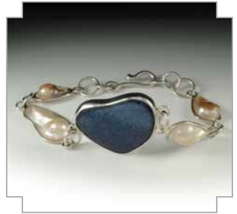
4.1 Bill Danberger Milky Way | Bracelet Silver, Hand Drawn Wire, Blister Pearl, Cab. Setting | $250