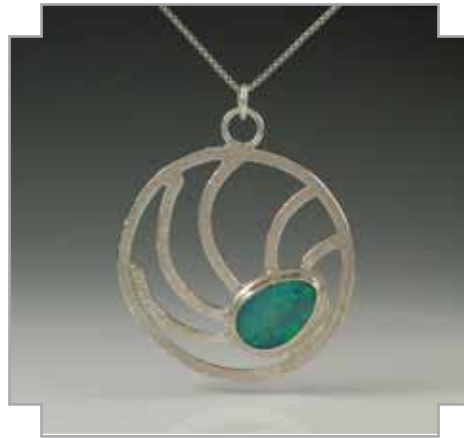
4.12 Nancy McLean Spiral Galaxy | Pendant Black Opal Doublet, Silver | NFS