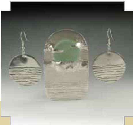
4.5 Greig Bishop Moon Over Port Hood | Pendant, Earrings Silver, Glass | NFS