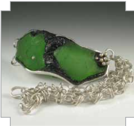
7.3 Harriet Burdett-Moulton Fractured Nebula | Bracelet Sterling Silver, Sea Glass, Diamond, Gold, Charcoal & Glue Mix | NFS