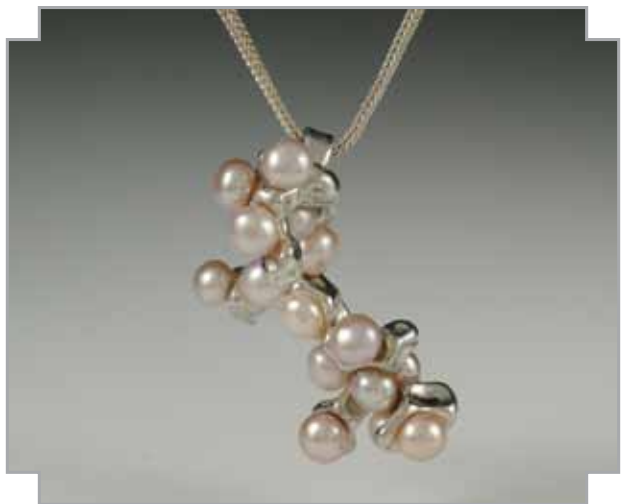
4.9 Teddy Tedford Cosmic Cluster of Pearls | Best Piece Open

What art offers is space – a certain breathing room for the spirit.