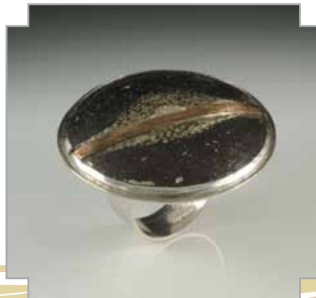
11.1 Peter Bauer Sombrero Galaxy | Ring Sterling Silver & Bronze | $398