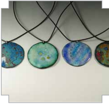
8.3 Larry Knox Nebula Series | Pendants (2 Sided) Copper, Sterling Silver, Leather, Enamel | $95/pr