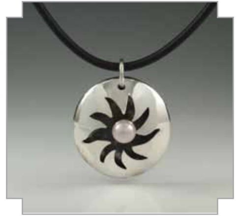
4.20 Candice Prior Floating in Space | Pendant Silver & Pearls | $75