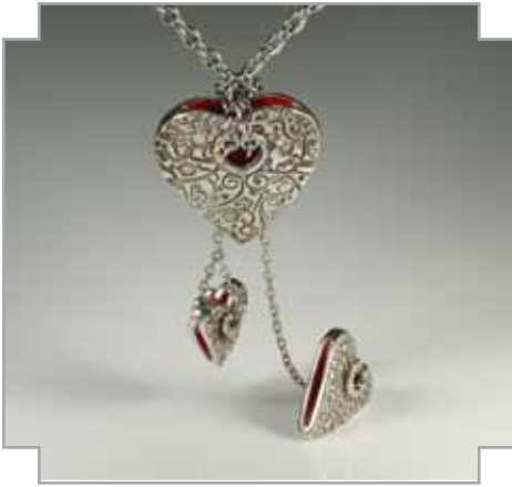
4.18 Pam Feindel Space in My Heart for You | Pendant Fine Silver Enamelled & China Paint, Stainless Steel Chain | $290