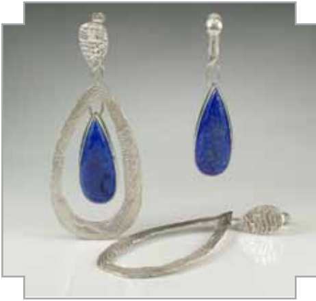
4.8 Teddy Tedford A Space for Tear Drops | 3 in 1 Earrings Sterling Silver, Afghanistan Lapis | NFS