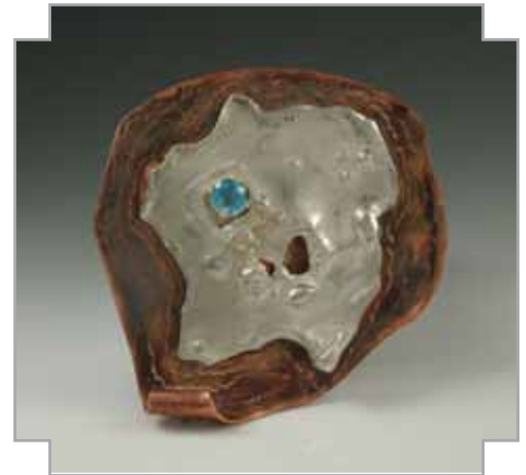
11.8 Candice Prior Blue Dwarf in Nebula | Pin Copper, Silver Blue Topaz | $75