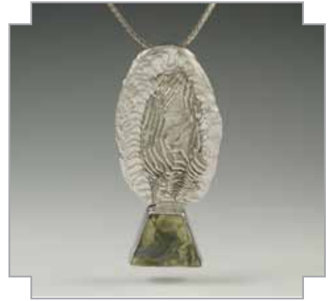
4.10 Teddy Tedford Flame Tree | Pendant Sterling Silver, Rhyolite in Fine Silver Bezel, Base Cuttle Fish Baile | $175