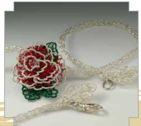
11.2 Claudia Schibler Immortal Love | Pendant on Attached Cord Coated Copper Wire, Swarovski Crystals, Purchased Clasp | NFS