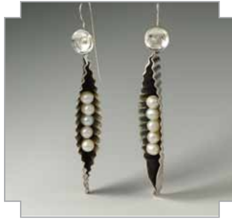
4.19 Candice Prior What's Inside 2 | Earrings Fresh Water Pearls & Sterling Silver | $100