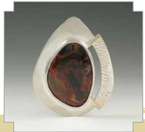
4.16 John Downie I Need A Little Space | Pendant 925 Silver, 800 Silver, 14K, Pietersite | $180