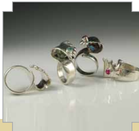
8.1 Bill Danberger Galactic Tsunami | Qty (4) Rings Silver, Gem Stones, Glass Bead | $275

Production requires submission of a series of at least 4 items designed to be produced in quantity. They may be identical or be variations on a design theme.