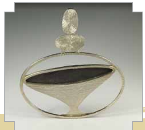
3.2 Peter Bauer Glimpse of Infinity | Pendant Sterling Silver | $498