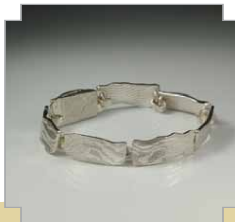
3.1 Teddy Tedford Current Space | Bracelet Sterling Silver | $350