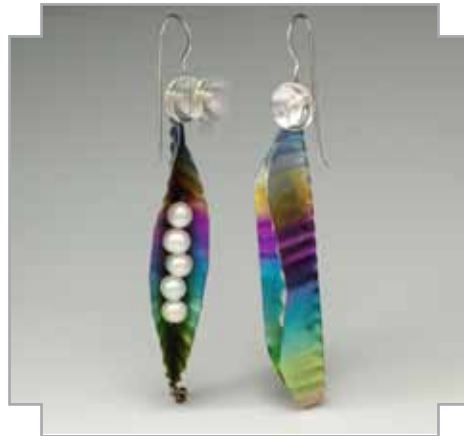
11.7 Candice Prior What's Inside I | Earrings Fresh Water Pearls, Niobium, Sterling Silver | $100