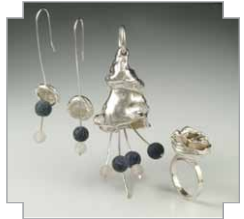
4.4 Greig Bishop Asteroids Pulled Into Black Hole | Pendant, Earrings & Ring (Suite) Silver, Glass Beads | NFS