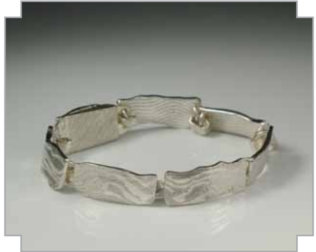
3.1 Teddy Tedford Current Space | Best Piece All Silver The Nora Goreham Trophy