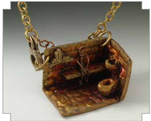
7.2 Cathy Logan Historical Confined Space | Honourable Mention Alternative Materials